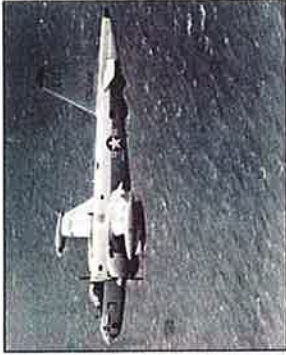
Lockheed P-2 Neptune 1947-1984