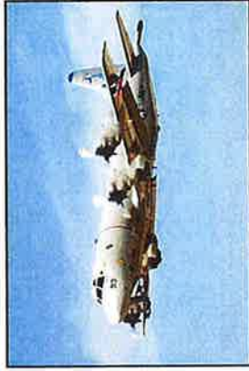
Lockheed P-3 Orion & Aries 1962-Present