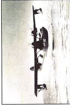
Consolidated PB4Y Catalina 1936-1957